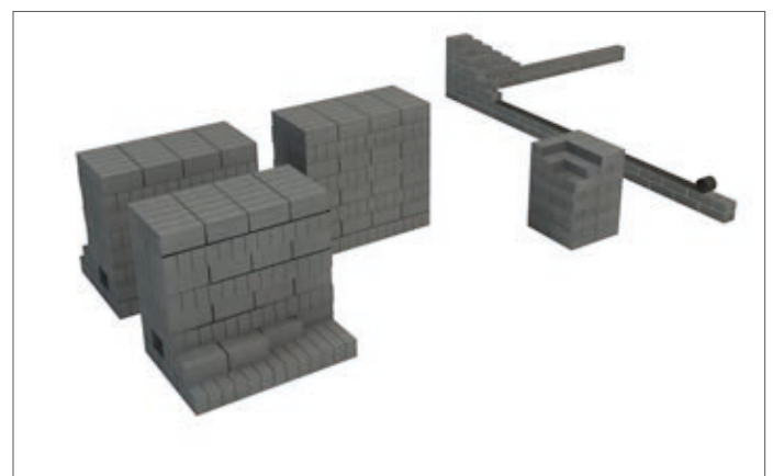
Blend from a minimum 3 packs.

It is important when constructing large expanses of blue brick to mix bricks thoroughly between packs and deliveries to minimise the clustering of tone and shade variation.