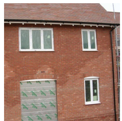
Saturation occurring prior to roof & window placement.

Although the instructions contained in this publication and any other information published by Ibstock Brick Ltd are believed to be accurate at the date of publication, they are strictly for guidance only and Ibstock Brick Ltd accepts no liability in relation to their use or for any losses, howsoever caused. You are responsible for taking all reasonable steps to ensure your use of the product conforms to all applicable health and safety requirements from time to time. If in doubt, please consult appropriately qualified persons. All products sold by Ibstock are sold subject to Ibstock's Terms and Conditions of Sale, a copy of which is available on request.