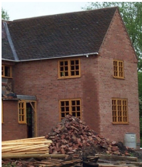
Saturation occurring where downpipes have not been installed.

During rainfall, saturation of masonry can be intensified by other components, for example rain-water outlets prior to the down-pipes being fitted or scaffolding boards adjacent to freshly constructed masonry. The after effects will be localised darkened patches.