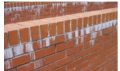
Lime stains emanating from mortar. No damp proof membrane has been incorporated under the brick edge capping.

A strong mortar mix is necessary for the durability of the brickwork. Do not recess mortar joints. Consider whether brickwork will be adjacent roadways where de-icing salts will regularly be used.