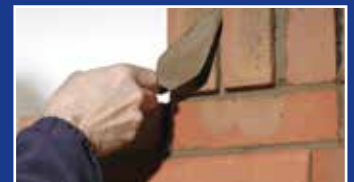
Step 5 Point up the joints