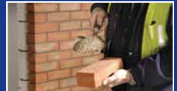
Step 4 Standard bricks are continued until the next detail is required