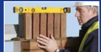
Step 3 Check they're level