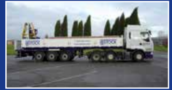
Step 1 Units are delivered to site ready for installing