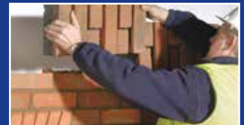
Step 2 Units are placed in position on a mortar bed